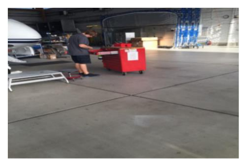
Figure 5 Observation to Cessna Service Centre