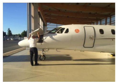
Figure 4 Observation During Pre-Check Prior Departure