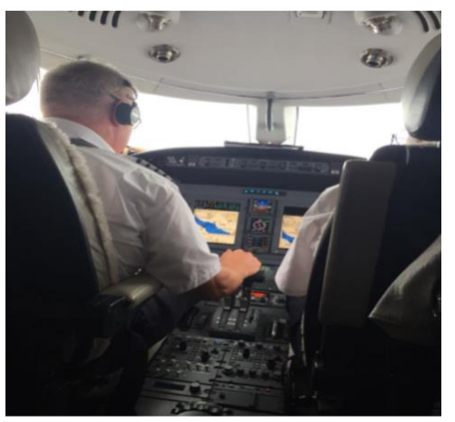
Figure 3. Flight Section Observation of IFM Traviation Operation